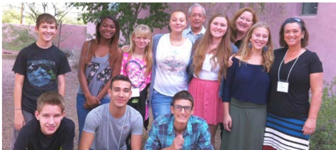
Youth and Advisors at Papago Buttes Church of the Brethren

Nine youth and three advisors attended District Conference 2013. Relationships between the youth of our district and the lucky adults who volunteer as advisors, continue to deepen because of the Youth Cabinet’s efforts. Their service is greatly appreciated!