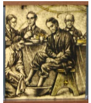
Painted window at Bethany Seminary