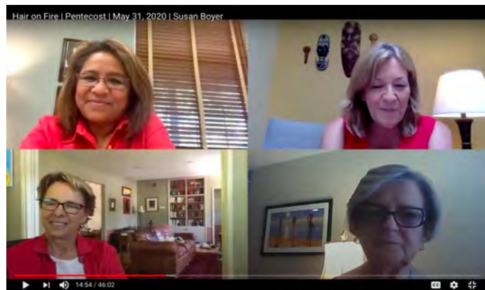
La Verne CoB Pentecost gathering welcomes new members.

And the reality is that most churches are finding more than one way to connect with each other. They may have women's or men's groups meeting in Zoom, prayers services on YouTube or Zoom, Bible studies have seen an increase in participation or even new ones have started. Several churches have taken in new members during this time, using video introductions or a special Zoom gathering.