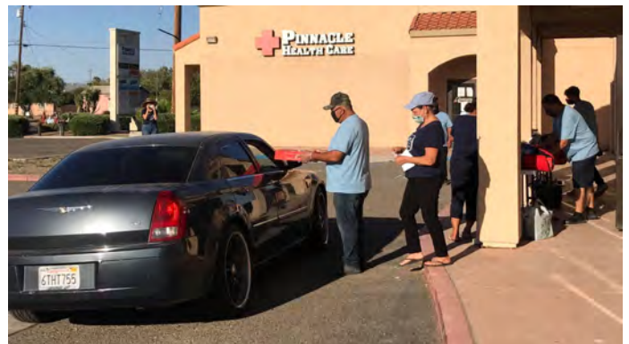
Centro Ágape en Acción handing out family dinners

All six of our Spanish language congregations and projects were able to receive grants and the funds have been used to help their own members and community members with rent and utilities, provide food baskets and grocery store gift cards, help with funeral expenses, increase meal delivery ministries, and more. Centro Ágape en Acción (Los Banos) included a family dinner night as part of their grant. They provided Pizzas and Soda for forty families who drove by their new facility to pick up dinner.