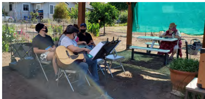
Glendora CoB worships under the gazebo by their labyrinth and garden.

One of the challenges for churches is the length of time as closures have continued over the months. Early hopeful thinking was that by Easter, and then by Pentecost, gatherings in church buildings might be able to resume. In early June a few congregations began to gather again, implementing temperature taking at the doors, encouraging facial coverings, and having socially distanced seating. But then the states in which PSWD is present all began to experience a surge in the virus and soon the health officials were saying singing needed to stop when gathered together, and a few weeks later came the suspension of gathering indoors for worship. These are challenges for all as folks welcomed the chance to see one another in person and to be in a space which provides comfort and a sense of closeness to God.