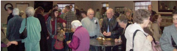
Waterford congregation reception