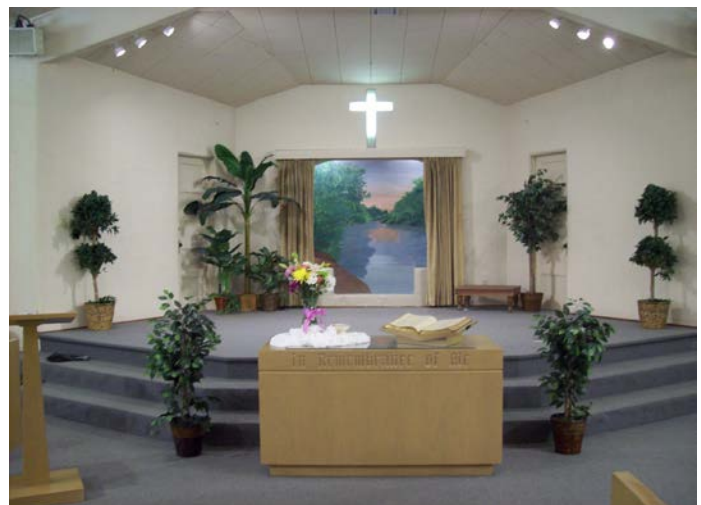
Waterford Church of the Brethren Sanctuary