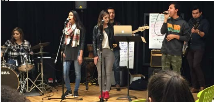
WRYC Praise Band

Over MLK Weekend 2016, 45 youth and advisors, mostly from California and Washington, gathered at the University of La Verne for the Western Regional Youth Conference, on the theme "Becoming the Beloved Community." Praise bands from Cristo Sión, Príncipe de