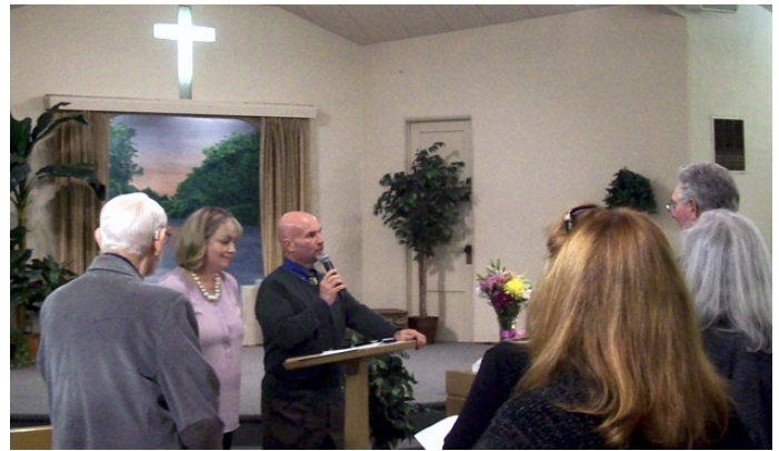
District Executive Minister with congregation

buildings and exploring what might make sense for the future of this site. Final decisions will come in the months ahead as the work continues, and an action to formally dissolve the congregation will be on the agenda for District Conference 2016 in Modesto.