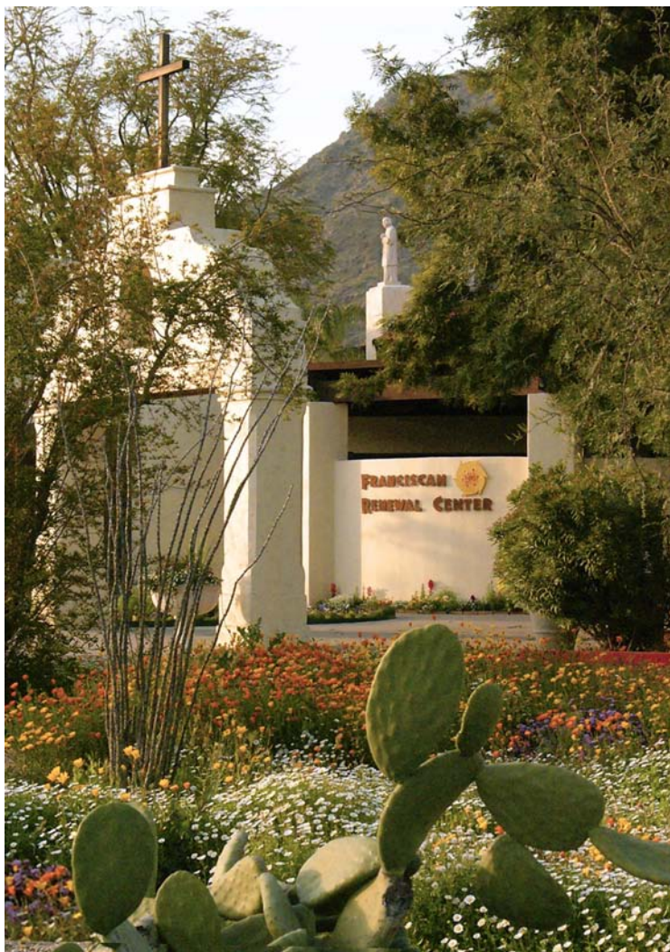
Franciscan Renewal Center