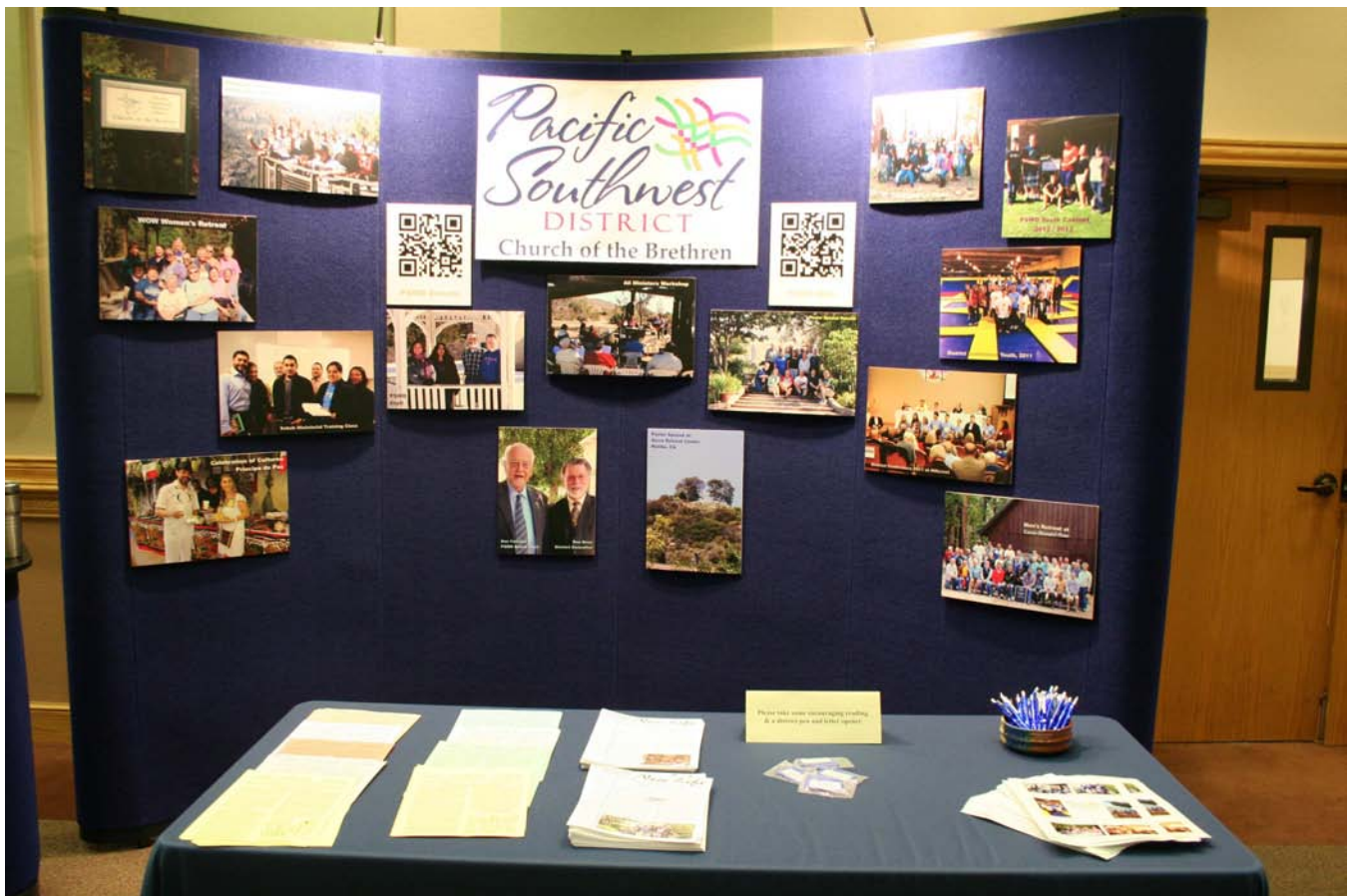
2012 Board of Administration display at District Conference