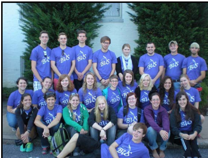
The 2012 fall orientation Unit #299 gathers for a picture at the Brethren Service Center in New Windsor, Maryland, before heading out to work in the New Windsor community.