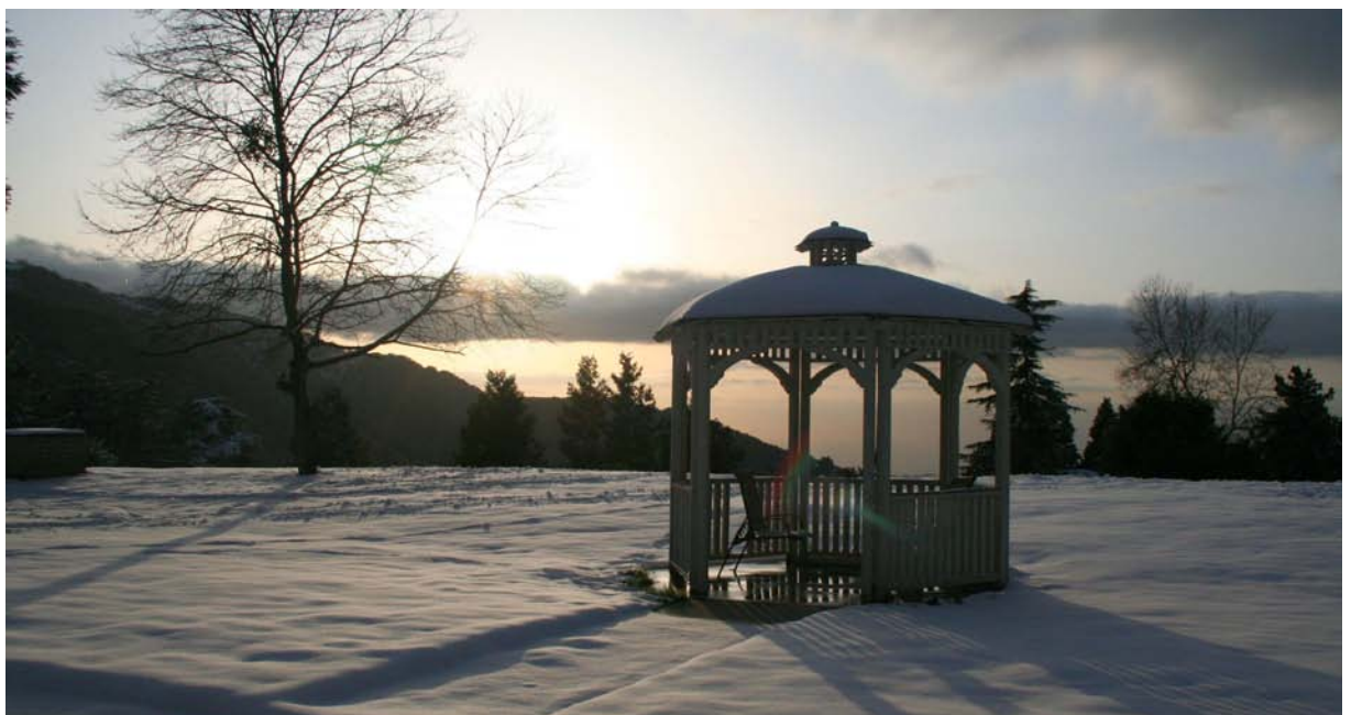
Gazebo, overlooking the Los Angeles basin, surrounded by water.