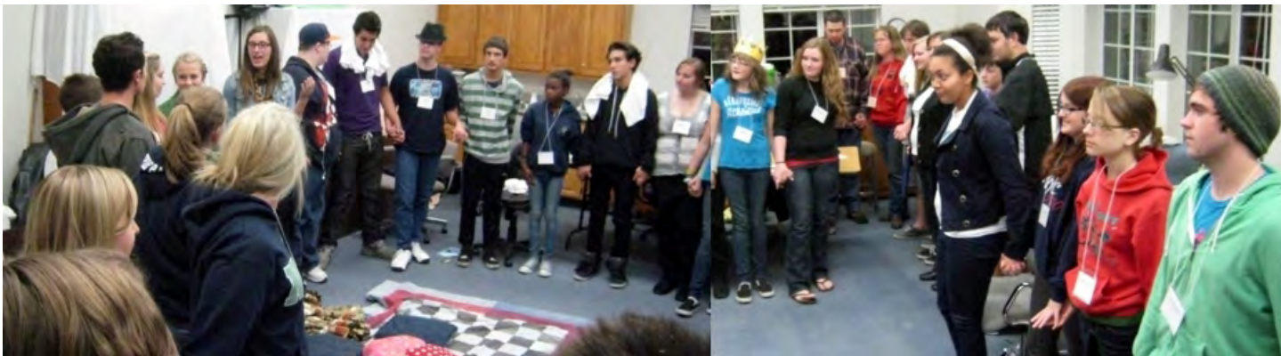
Gathered in the District Conference Youth Room after Friday Worship.