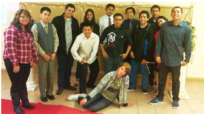
Príncipe de Paz Youth Group