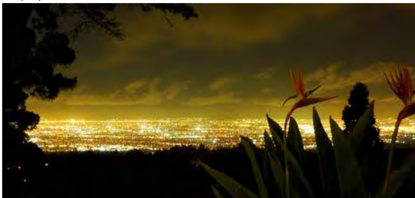
View of Los Angeles from the 2010 Pastors Retreat